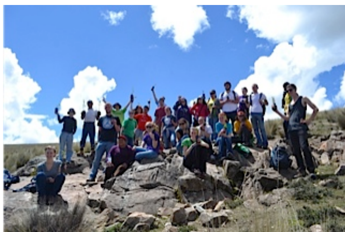
Second day of Planting with Goshen students