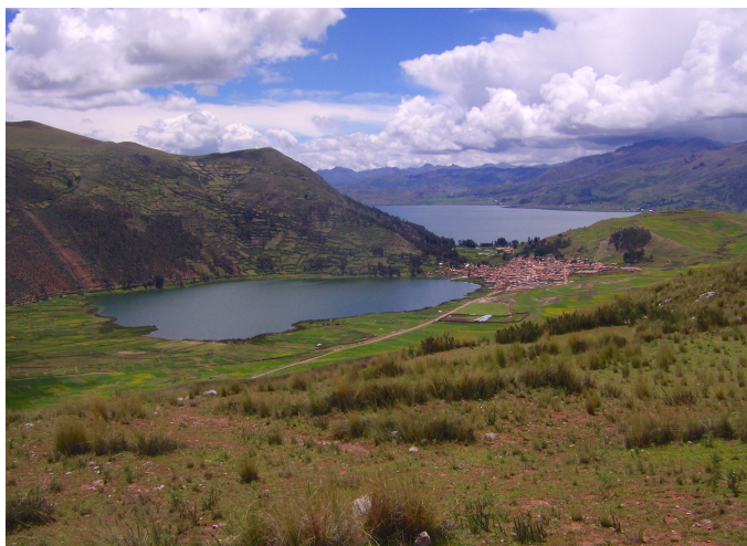
Village of Acopia, with Lake Acopia in front and Lake Pomacanchi in rear.

These lakes are Laguna Acopia near the village of Acopia - native village of Yachay Wasi president Luis Delgado Hurtado -, Lagunas Pampamarca and Asnacocha near the village of Mosoqllaqta, Laguna Pomacanchi near the village of Pomacanchi. There are Indigenous communities living near these lakes with an estimated population of 25,518 inhabitants. The lakes are located at an altitude of 3600 meters.