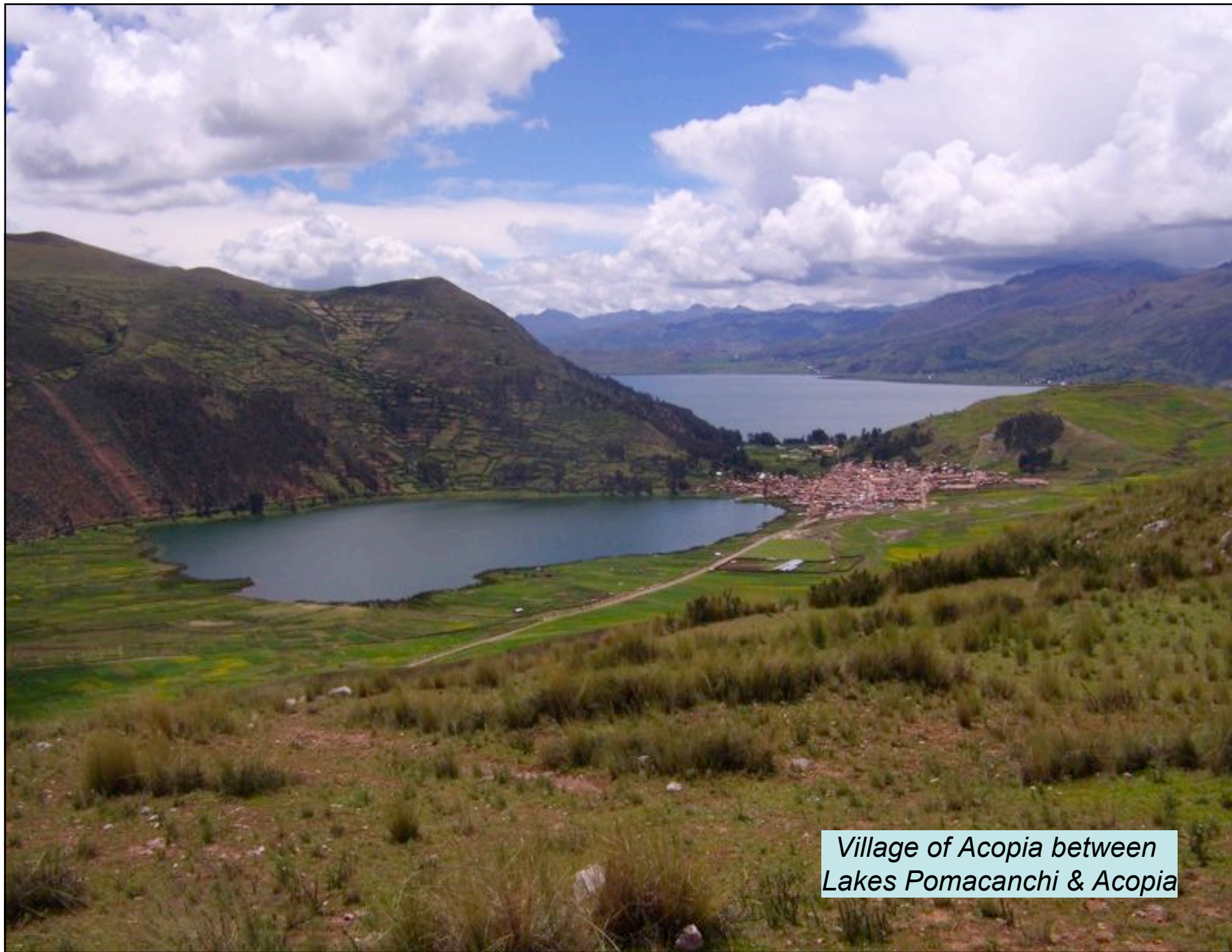
Village of Acopia between Lakes Pomacanchi & Acopia