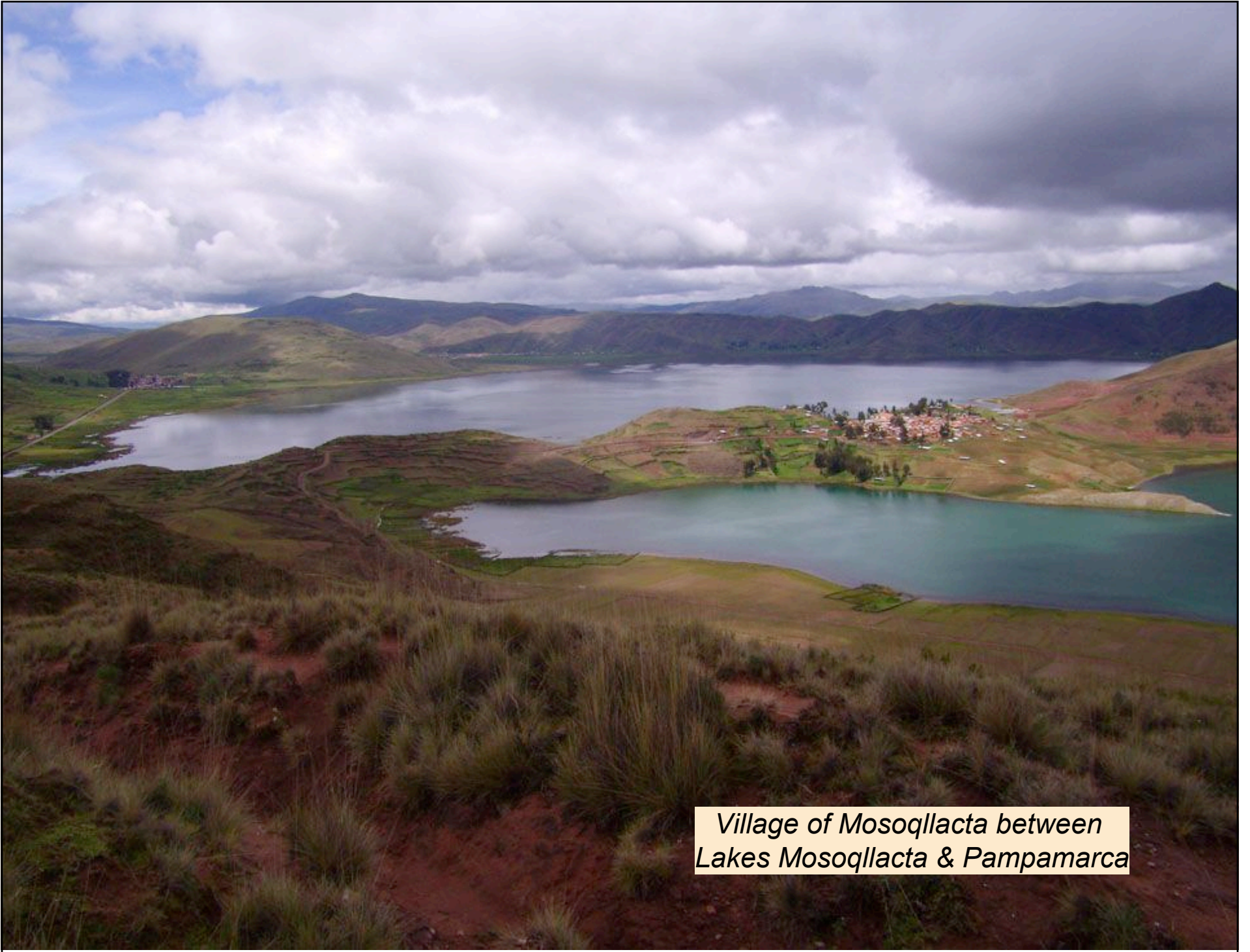
Village of Mosoqllacta between Lakes Mosoqllacta & Pampamarca